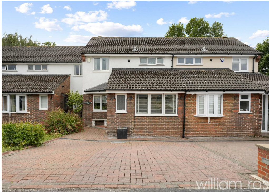
42 Owen Gardens, Woodford Green, IG8 8DJ